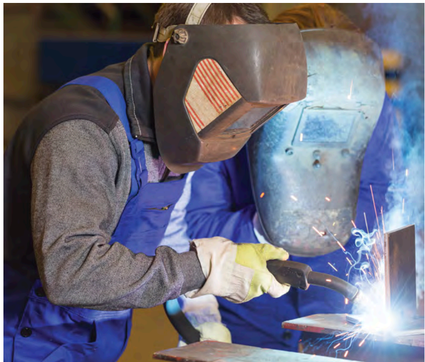
This year, the AWS Foundation plans to award up to $250,000 in grants to qualified welding training institutions.